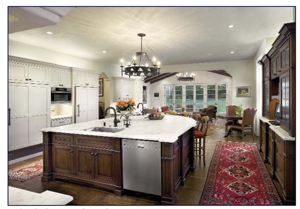
Kitchen looking towards Family Room.

Kitchen (25' x 20'): Follow the hall towards the heart of the house – the masterfully crafted kitchen with a 10' ceiling, original