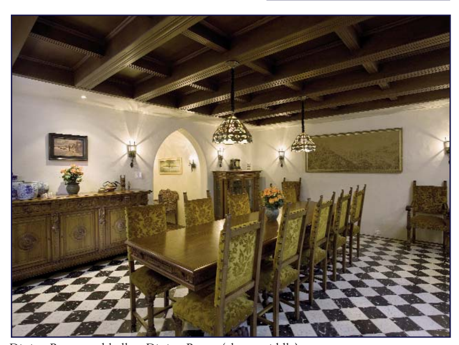
Dining Room and hall to Dining Room (above middle).