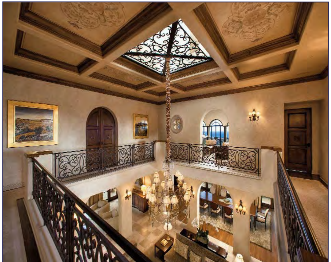
Above is the enclosed covered loggia and second floor mezzanine