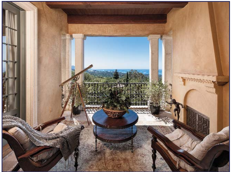
Covered second floor loggia off the mezzanine & master bedroom

A relaxing retreat with French doors to a private balcony with sunset and harbor views, and windows to the front motor court and mountain views, three tall double doors to closets with built-in cabinetry, including a sewing closet and ample storage, and a full bath with ocean views, a Jerusalem gold limestone vanity countertop, and shower.