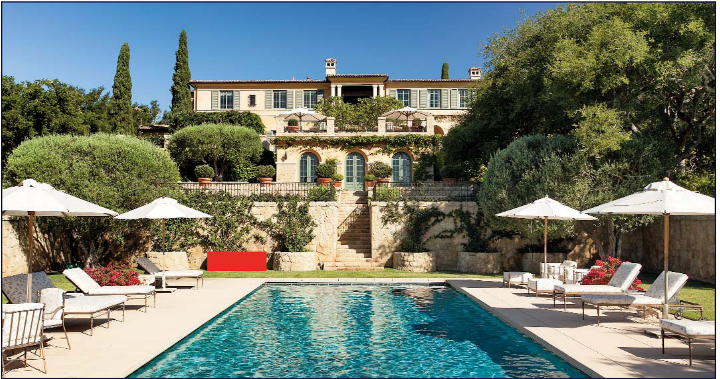
65-foot pool with view towards guest house terrace and main house above