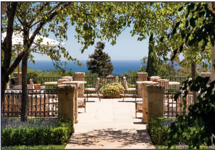
The ocean view entertainment terrace above left, a long recirculating stream with three large ponds at top right, and the sporty seven-hole putting green.