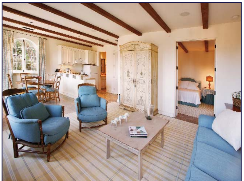
One-bedroom guest house

Stone double stairs lead down to the private guest retreat with arched French doors, a large living room, a kitchenette with a granite countertop, a spacious bedroom, and full bath with shower.