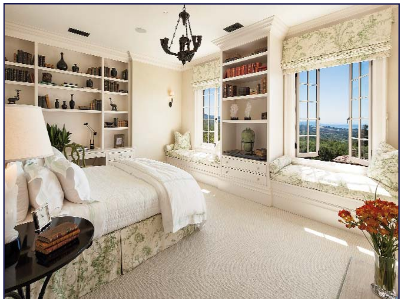
Light-filled family bedroom 4

Meticulous attention to details in this room begin with a custom Venetian glass chandelier and sconces, two large windows with window seats overlooking the gardens and pool area with panoramic ocean, island, and Montecito Valley views, extensive built-in bookcases, cabinetry, and a desk that all create this distinguished space. There is a walk-in closet with built-in dresser, and a full bath with an ocean view window, ceramic tile floor, ceramic tile vanity, and shower over tub.