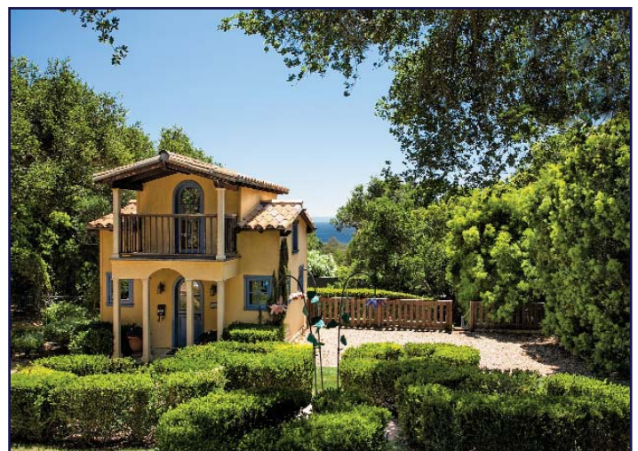
“Kid’s World” playhouse and gardens