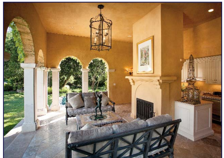
Luxurious pool house open to the pool and entertainment deck

Two garages each house three cars with wide doors, wrought-iron exterior lanterns, indirect interior halogen lighting, hand-painted epoxy floor, a motion-controlled security system and an audio control panel create a functional space for any vehicle.